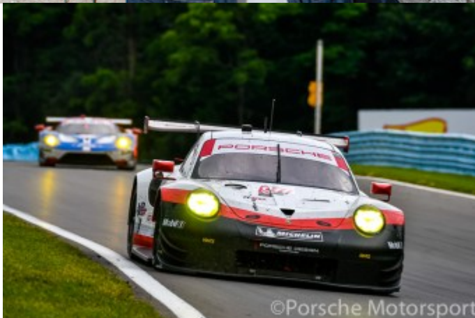
6 Hours of Watkins Glen, 2 July 2017: Patrick Pilet and Dirk Werner finished seventh in the GTLM class driving their #911 Porsche 911 RSR